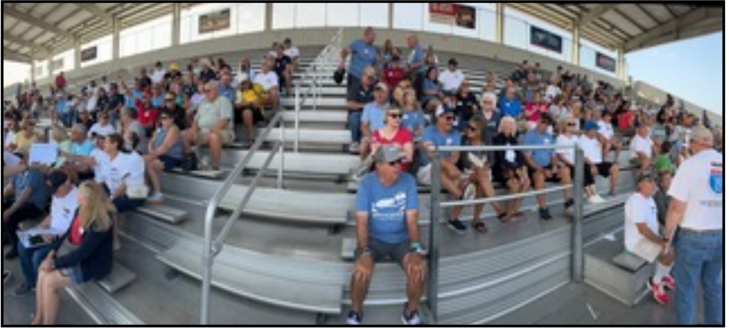
THE GRAND STANDS