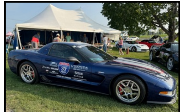
Our Captain’s Lead Corvette for our Atlantic Caravan