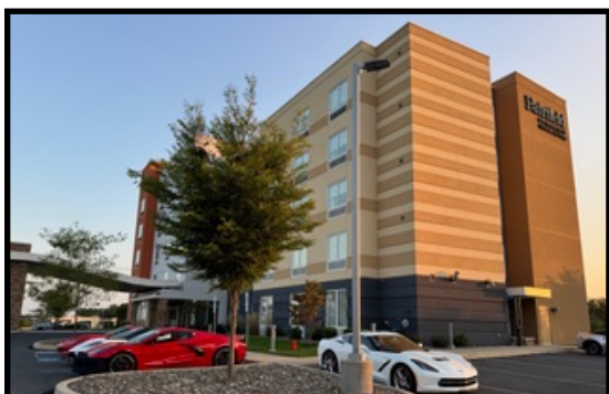
Below: Our Embassy Hotel, Mechanicsburg, PA